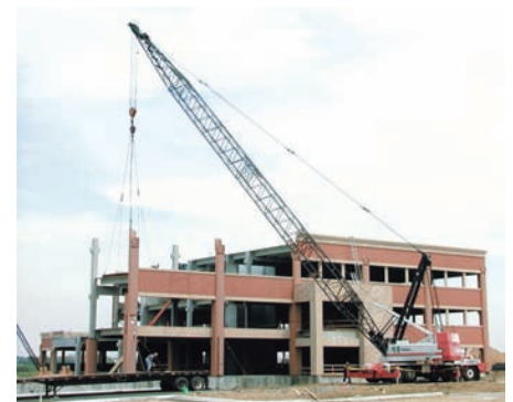
Precast panels being delivered just in time to the site.