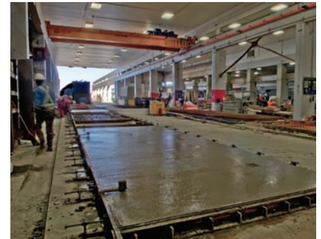
Insulated wall panels being quality controlled manufactured on long line beds.