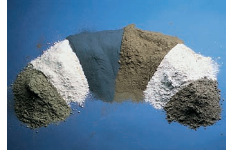
SCM'S reduce the embodied energy of precast concrete products by substituting waste materials for cement.

The availability of 3rd party verification - based on life cycle assessments (LCA) – provide re-assurance about the accuracy and comparability of environmental product data.